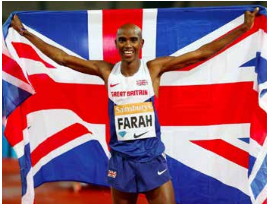
Great Britain's Mo Farah celebrates after winning the Men's 3000m at the Sainsbury's Anniversary Games in London, July 2015

Publication Business Insider Date 27 October 2016