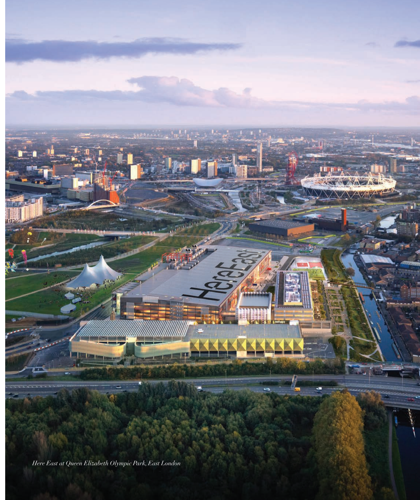
Here East at Queen Elizabeth Olympic Park, East London

As well as providing a new community destination featuring a landscaped canal side with artisanal cafes, shops and restaurants, Here East is expected to create over 7,500 jobs, including 5,300 on-site and a further 2,200 in the local community. Tenants to date include BT Sport, Loughborough University, Hackney Community College, Studio Wayne McGregor and Infinity SDC.