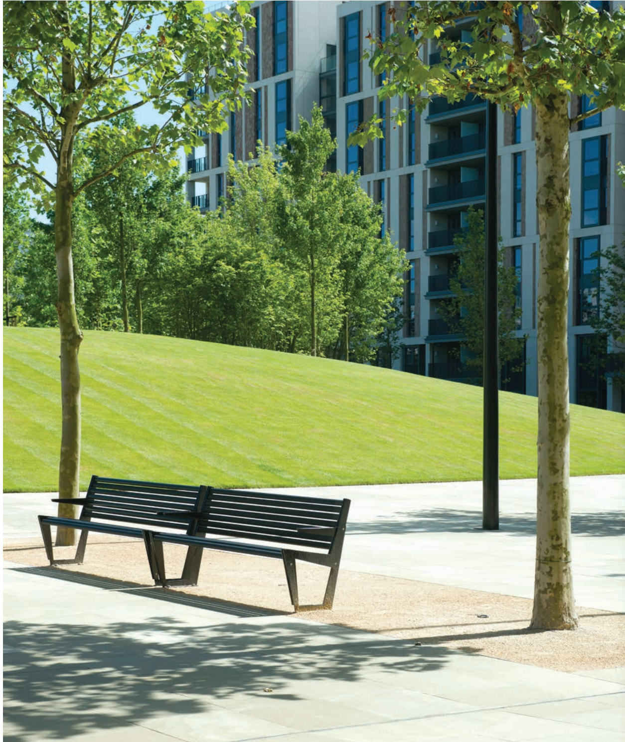
East Village, East London