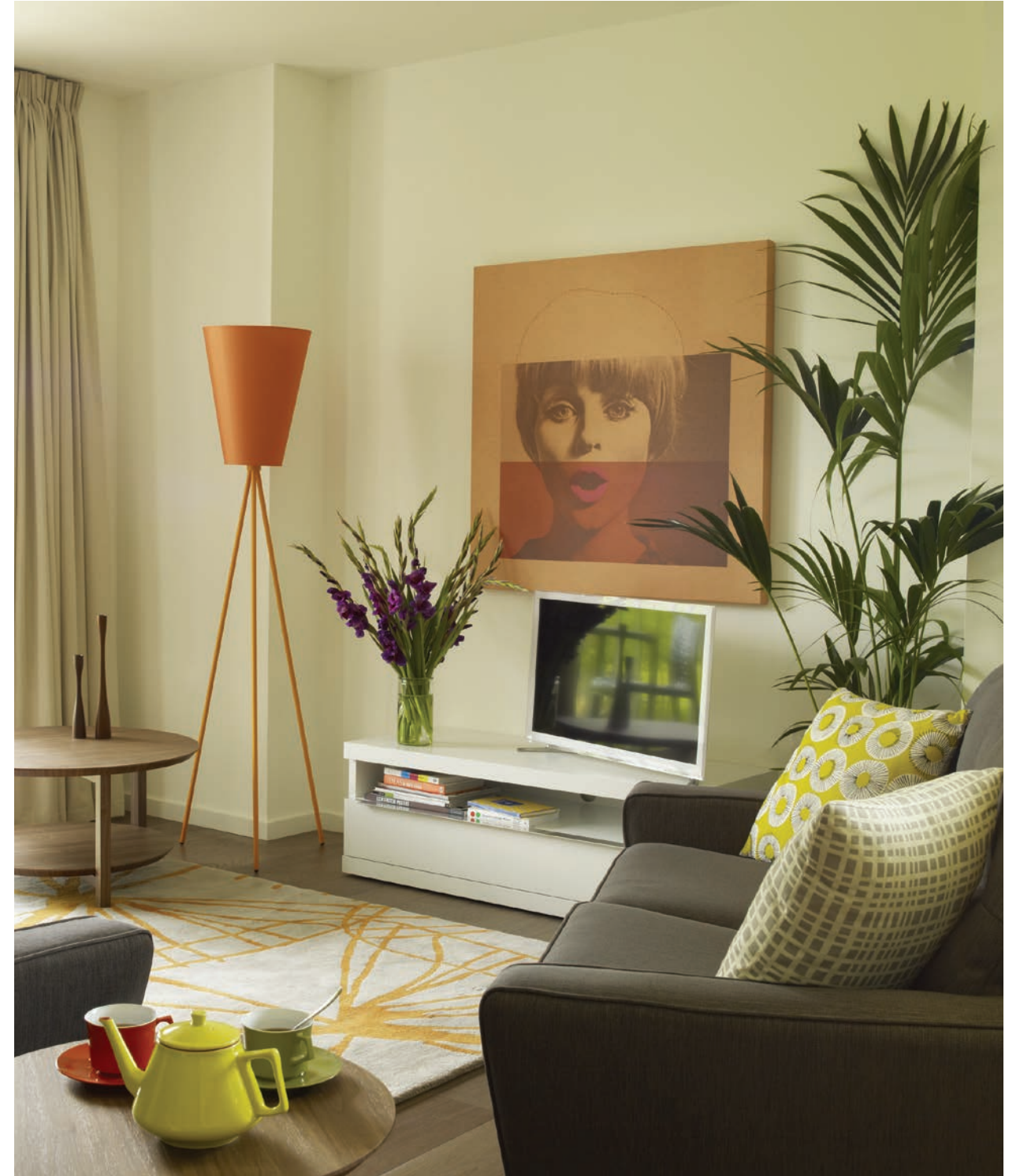
Get Living London at East Village, East London

With this approach Delancey aims to revitalise the experience and perception of the PRS market from a customer's perspective, hence driving long-term values and helping to establish an institutional investment market in this sector.