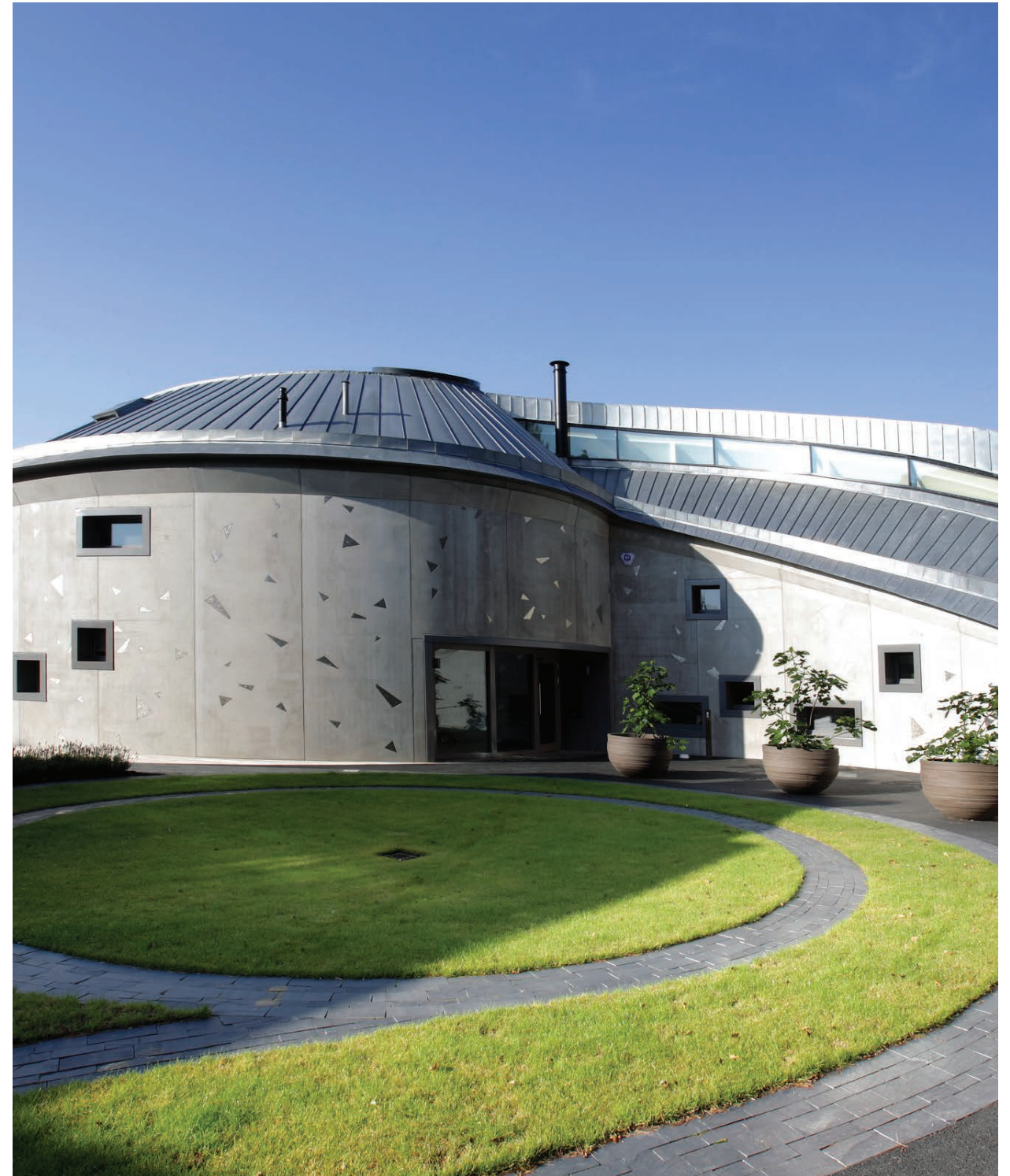
Maggie's Cancer Care Centre, South West Wales

Globe Theatre Maggies Cancer Care Centres Dulwich Picture Gallery The Duke of Edinburgh's Award LAPADA The Globe Snow-Camp Better Bankside The Wallace Collection