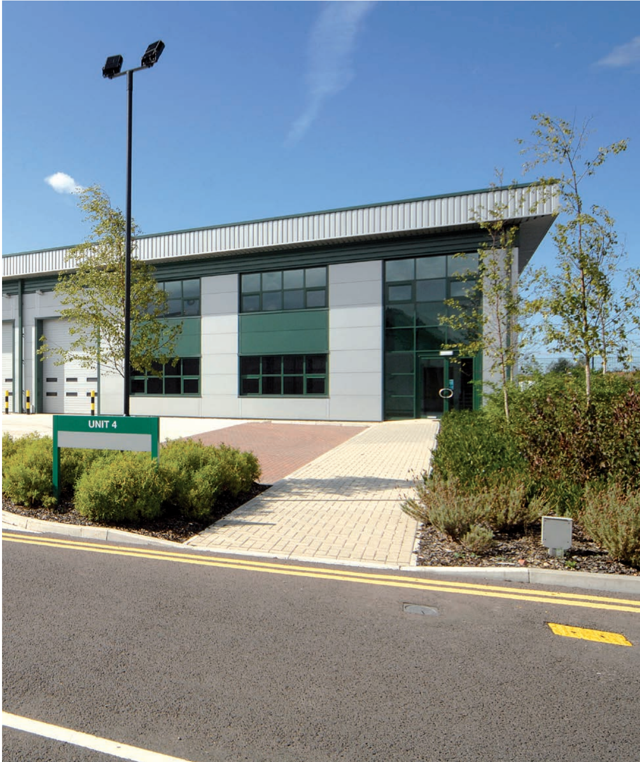
Central M40, Banbury