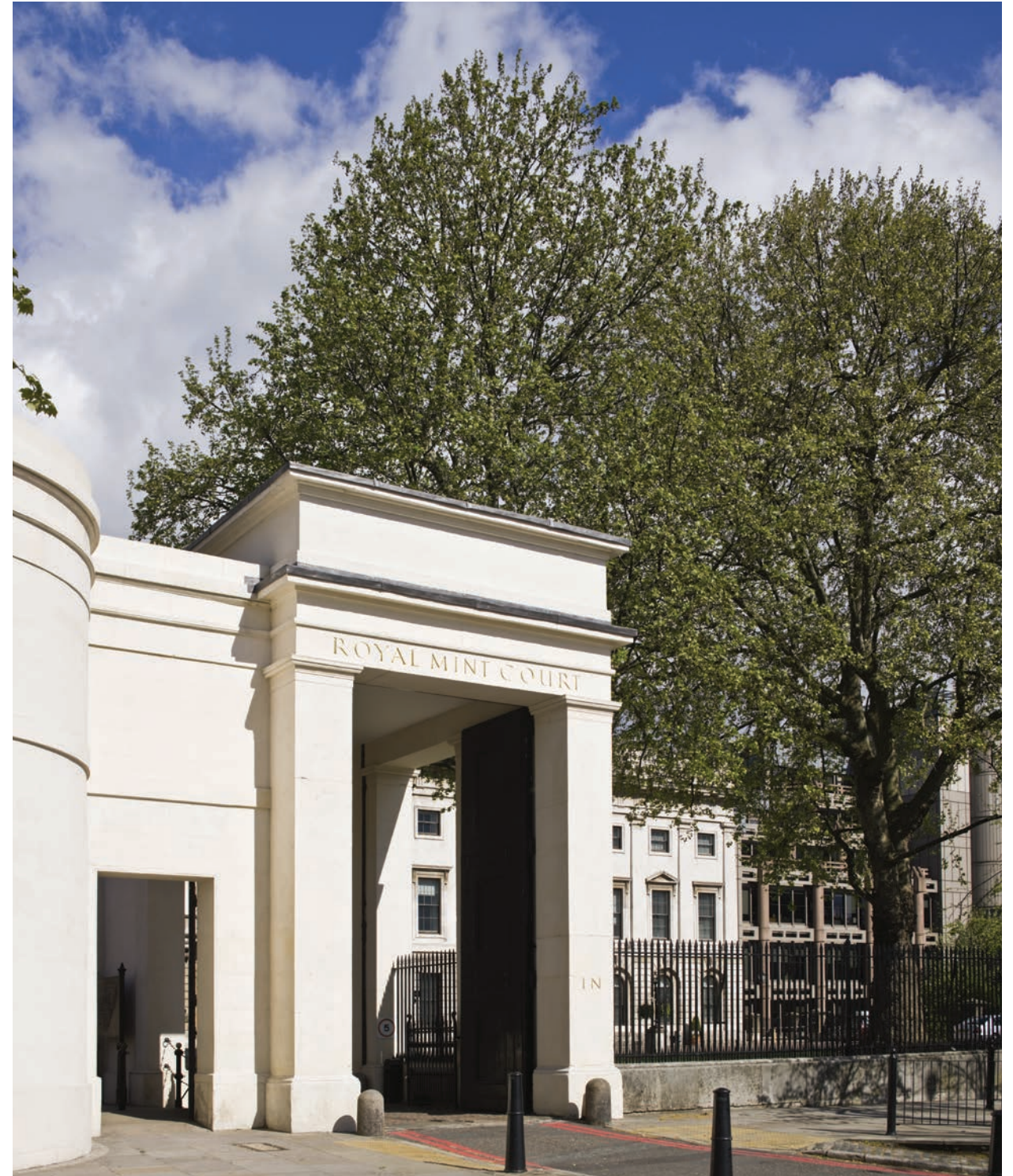
Royal Mint Court, City of London

Delancey is open-minded towards the establishment of new business platforms and has been involved in a diverse range of business formation initiatives, often in partnership with specialist management teams. We look for opportunities and sectors where the barriers to entry are high, favourable supply-demand fundamentals are present or an arbitrage between the public and private real estate capital markets exists. The successful exploitation of all such new business ideas requires, amongst other things, the relevant operational credentials, the necessary capital, the expertise to create the optimum corporate structure, the corporate governance skills to run the business and the ability to crystallise the investment.