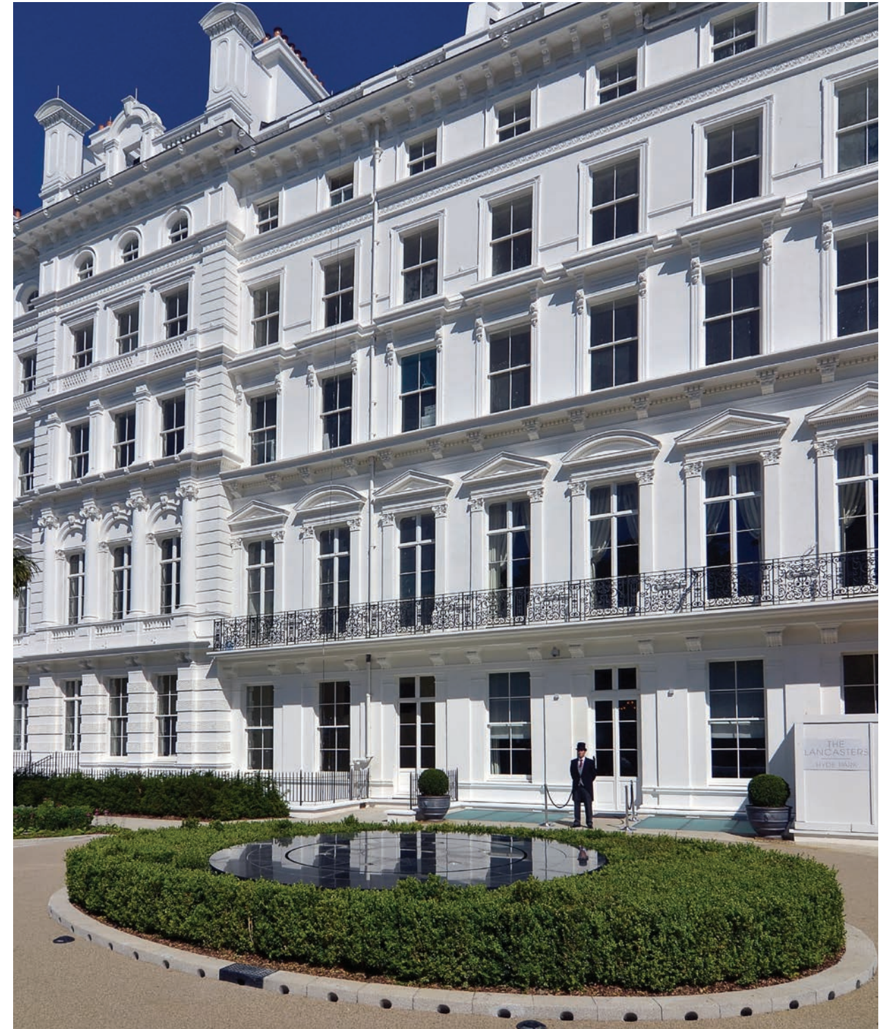
The Lancasters, Hyde Park, West London

Santander Franklin Templeton The Portman Estate Soros Real Estate Partners Sand Aire Ltd Ares Management, L.P. Galliard Residential The Safra Family Pearson Pension Property Fund Limited