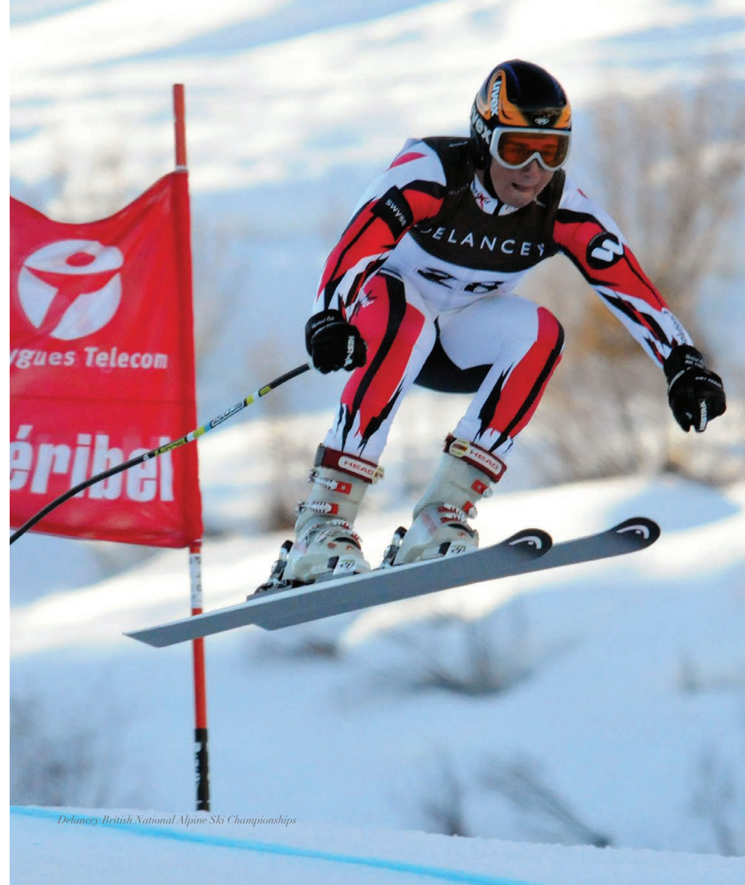
Delancey British National Alpine Ski Championships