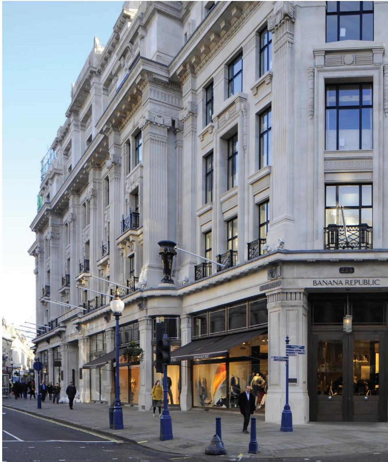
240 Regent Street, Central London

With a 20-year history of developing and managing high street retail assets, shopping centres and retail warehouse parks, Delancey seeks to create retail destinations that act as a catalyst for the regeneration of the neighbourhoods in which they are located or improve the appeal and retail offer of an already established location. Innovative solutions are achieved through continuous intensive research, a deep understanding of consumer and retailer behaviour, including the rise of the internet, and changing demographic patterns. We are committed to achieving the right balance of tenant mix and financial dynamics to achieve the best long-term rental growth potential out of each asset.