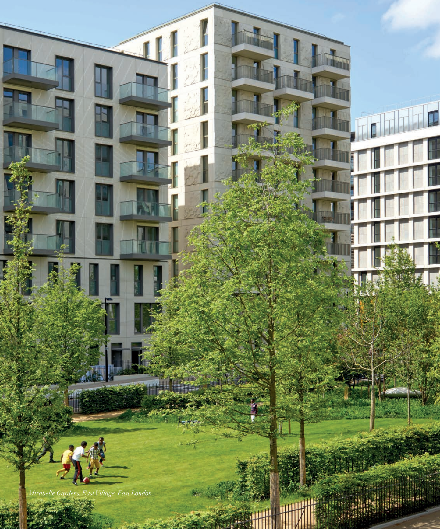
Mirabelle Gardens, East Village, East London