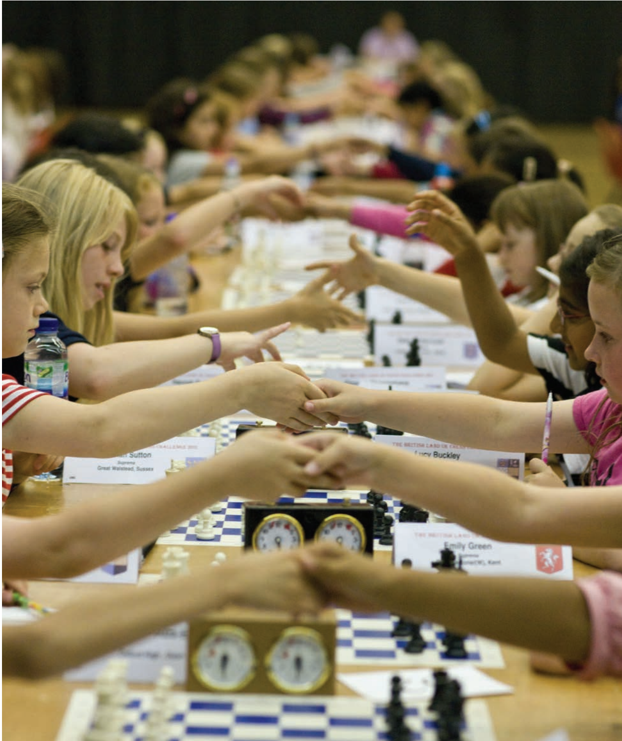
Delancey UK School's Chess Challenge