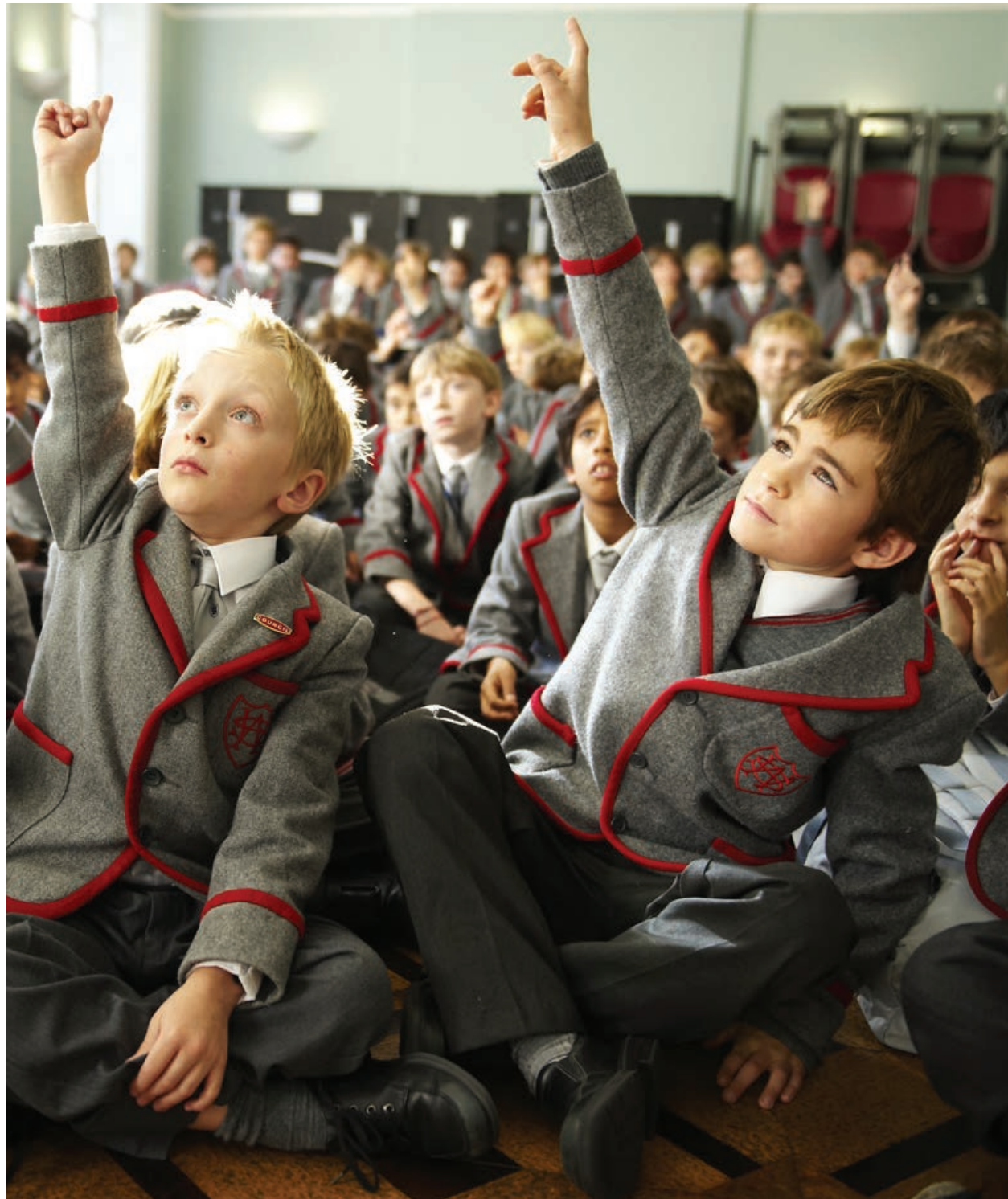
Wetherby Preparatory, West London, Alpha Plus Group